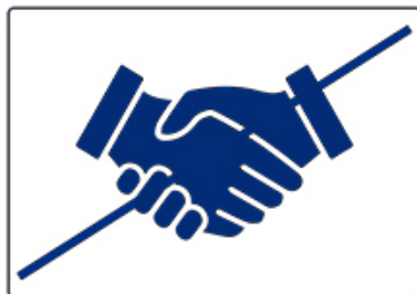
SIN CONTACTO FÍSICO