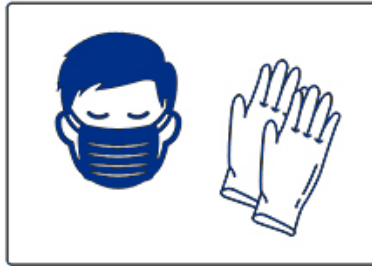
MASCARILLA Y GANTES