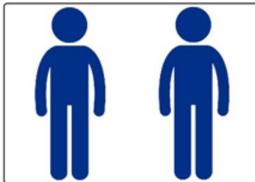
MÁXIMO 2 PERSONAS